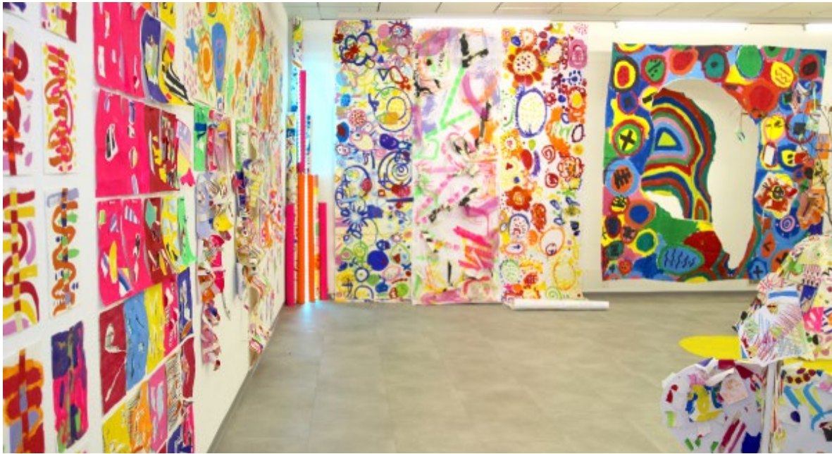
© MUSEO IN ERBA, Lugano (Switzerland)

Ideal exhibitions will probably have to be canceled, others are shortened like the magnificent exhibition at the Museo in Erba in Switzerland.